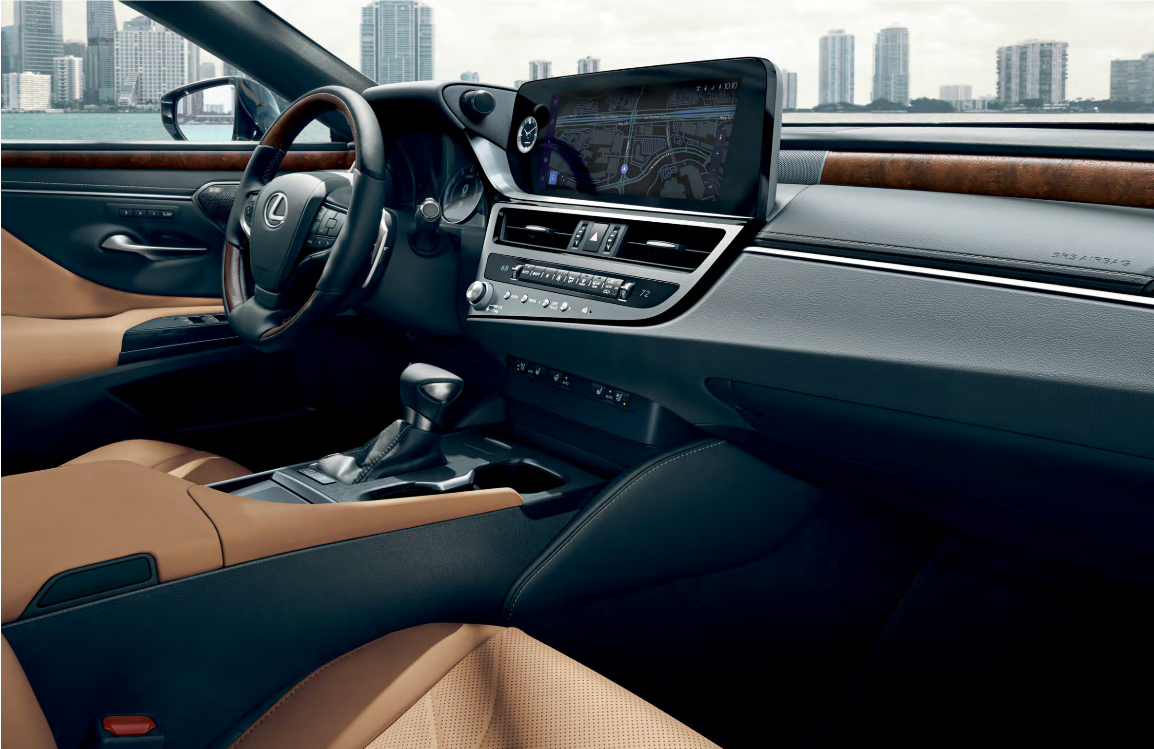
ES Hybrid shown with Palomino semi-aniline leather and Open-Pore Brown Walnut interior trim

With contemporary styling and cutting-edge technology, the ES offers a refreshing point of view on modern luxury. Discover thoughtful amenities like 10-way power-adjustable front seats with available heating and ventilation, designed to envelop you and connect you to the road. Unlike conventional ventilated seats, these pull air directly from the climate-control system to more effectively and efficiently cool you. These refined luxuries are complemented by numerous expressions of modern style and technology—from an intuitively positioned available 12.3-inch touchscreen display to available ambient lighting that accentuates the sculpted lines throughout the cabin.