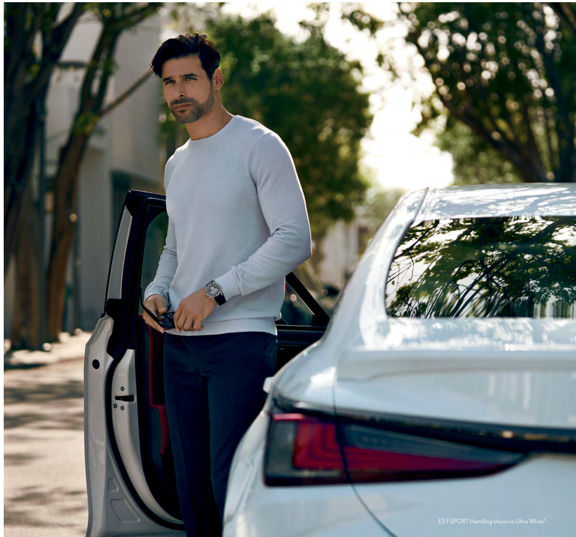
ES F SPORT Handling shown in Ultra White 9