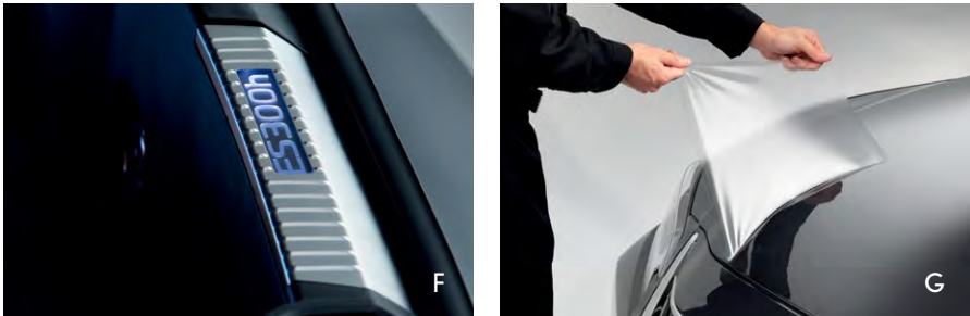
Previous model year shown