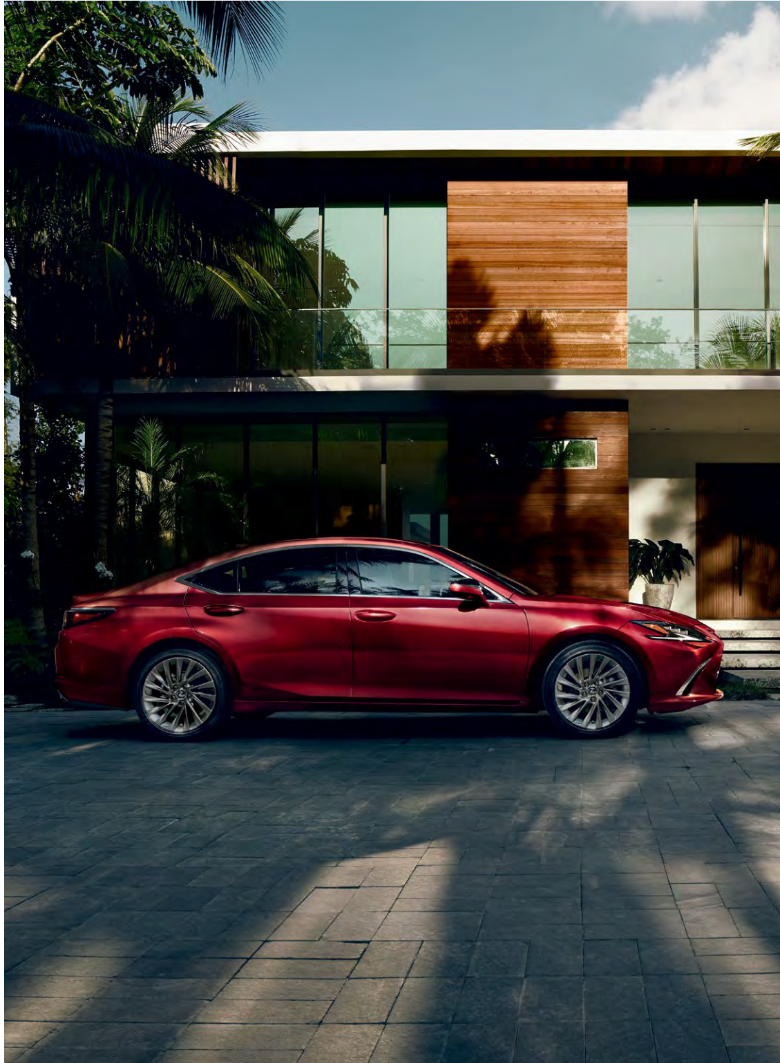
ES shown in Matador Red Mica