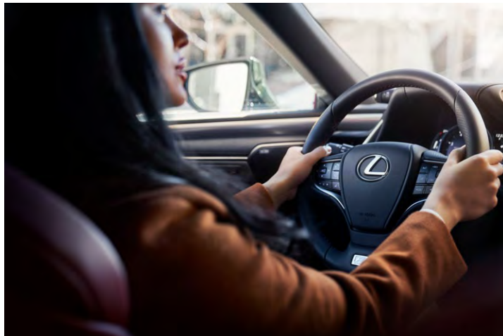
ES Hybrid shown with Apple CarPlay integration, Palomino semi-aniline leather and Open-Pore Brown Walnut interior trim

Featuring Lexus Interface 6 and innovations including wireless Apple CarPlay ®7 integration and an available Mark Levinson ®4 PurePlay audio system, the ES helps keep you connected.