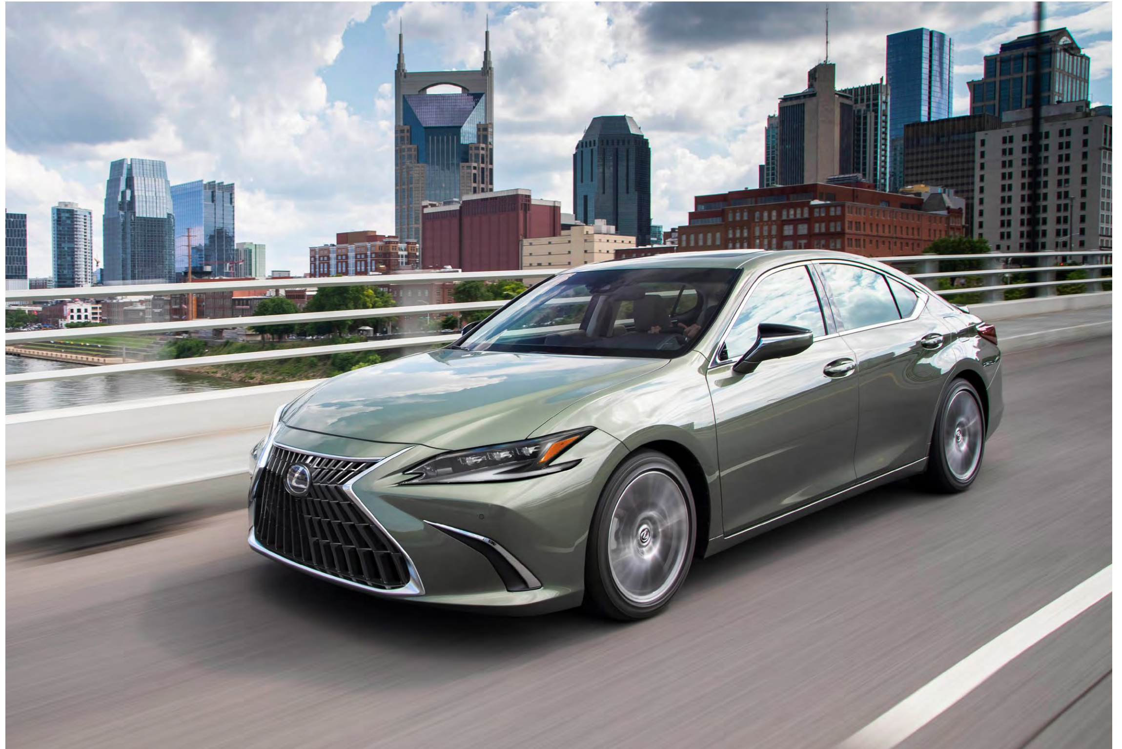
ES Hybrid shown in Sunlit Green

Combining next-generation hybrid technology and a highly potent 2.5-liter engine, this is the best of everything the ES has to offer. Its battery is not only remarkably small and lightweight but also strategically placed as close to the middle of the vehicle as possible for optimized front/rear weight distribution and a lower center of gravity. And with paddle shifters that deliver driving dynamics similar to the ES 250 AWD and ES 350, the ES Hybrid and ES Hybrid F SPORT models bring you even more of the amazing performance you've come to expect. Pairing powerful performance with an EPA-estimated 44 MPG combined, 2 it isn't just the most fuel-efficient Lexus sedan—it's the most fuel-efficient among all non-plug-in luxury sedans, 1 period.