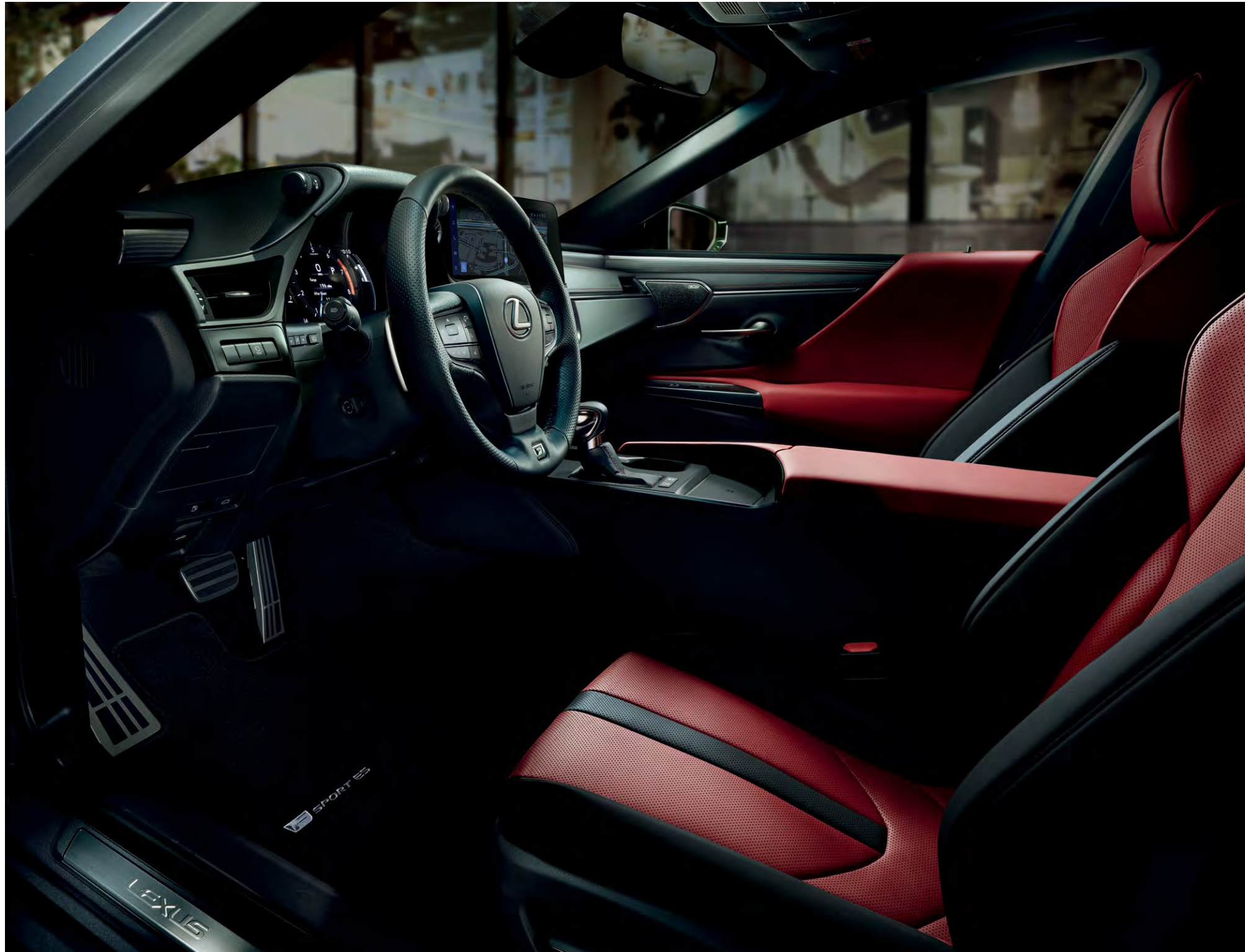
ES F SPORT Handling shown with Circuit Red NuLuxe® and Hadori Aluminum interior trim