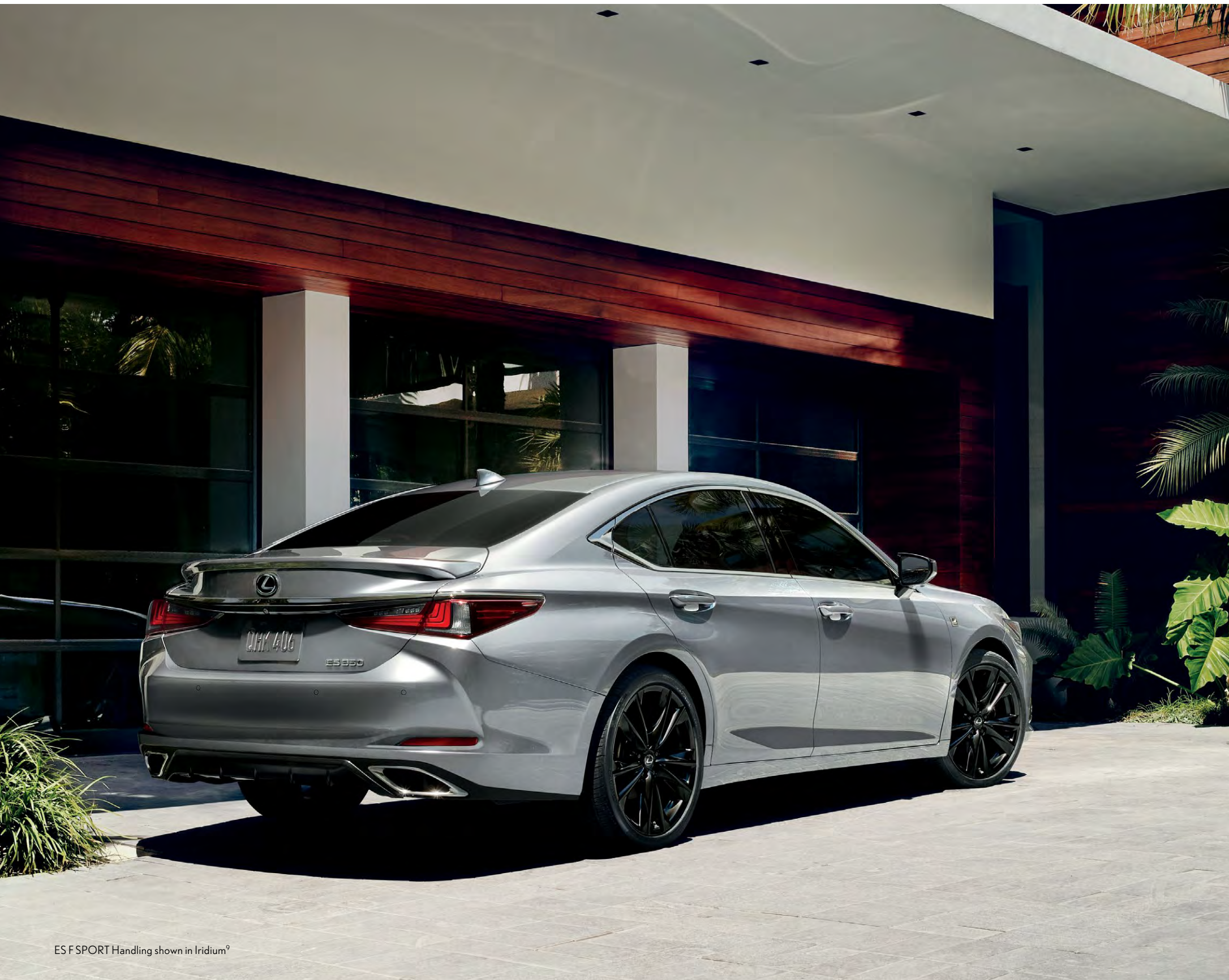
ES F SPORT Handling shown in Iridium 9